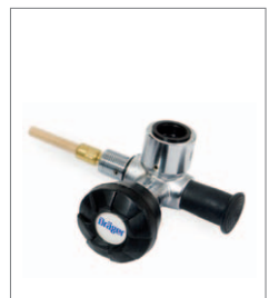
Right-angle valve With flame retardant hand wheel.