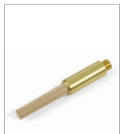
Excess Flow Valve (EFV)