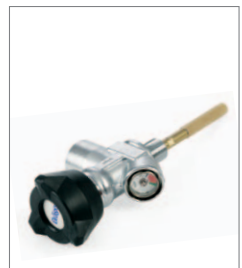
300 bar in-line valve with integrated gauge With flame retardant hand wheel.