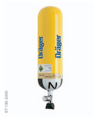
Valved carbon composite cylinder

Every batch of 200 cylinders is subjected to exhaustive testing in accordance with the legislative design and manufacturing codes (EN 12245 and 97/23/EC), under the supervision of a Notified Body. All relevant production data is retained electronically for the full working life of the cylinder.