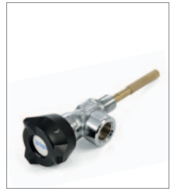
200 bar in-line valve With flame retardant hand wheel.